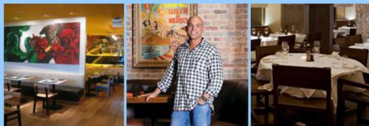
From left: Mercadoito, Rocco's Tacos, Solea